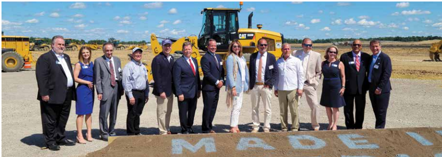
Staff members from OSC took part in the Intel Ohio groundbreaking on Sept. 9, 2022.