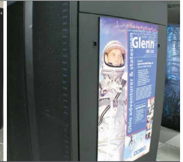
Glenn (Phase III, 2009)